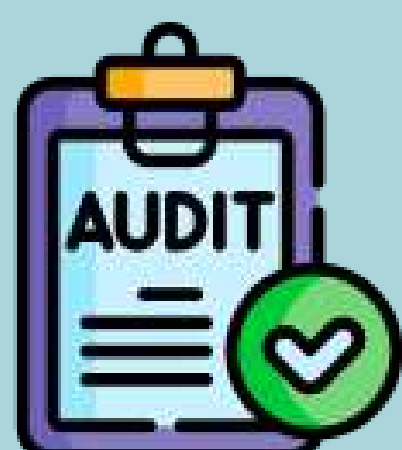
Audit & Assurance