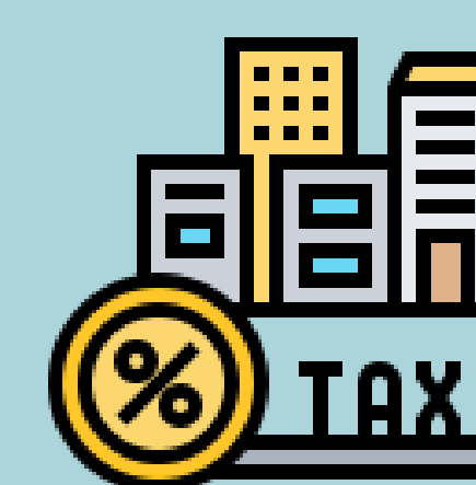
Corporate Tax UAE