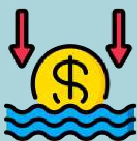
Liquidation & insolvency