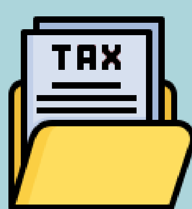
VAT Return Filing