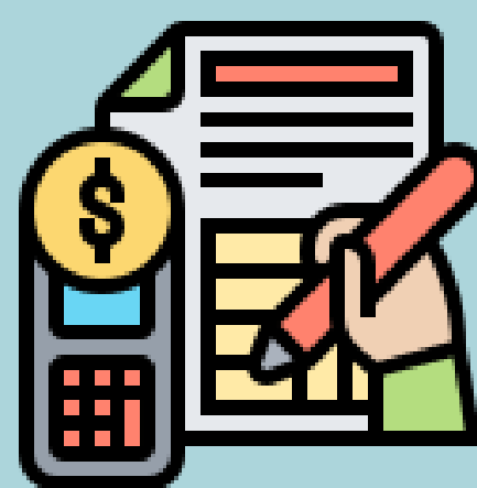
Accounting & Bookkeeping