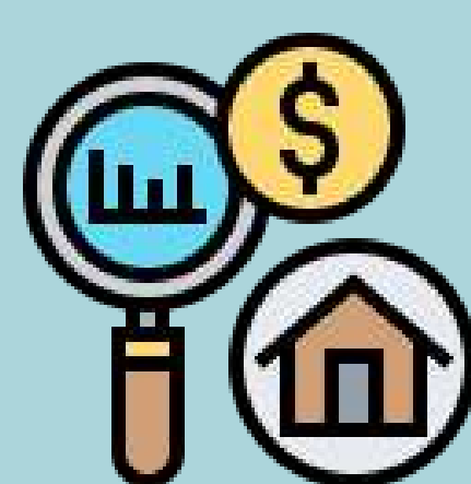
Valuation & Modelling